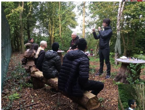
Fun in The Diggery