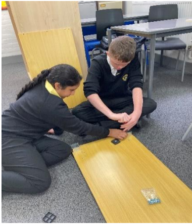
Life Skills – Building Furniture